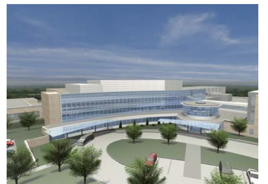
Above: A rendering of the new Patient Tower at OMH.